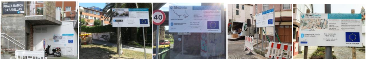
Ramon Cabanillas st. Victoria Fernández st. Pocomaco Industrial Estate Ntra. Sra. Rosario st. Cortaduría st.

In terms of regulatory reporting, ERDF co-financing has been reported in all cases. During the execution of each work, information signs have been placed in all of them: