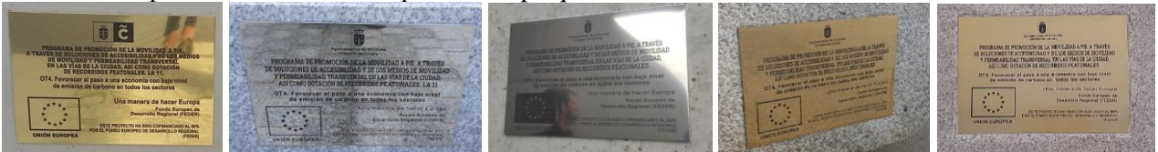
Ramon Cabanillas st. Victoria Fernández st. Pocomaco Industrial Estate Ntra. Sra. Rosario st. Cortaduría st.

After the completion of each work, a permanent plaque was installed in each street: