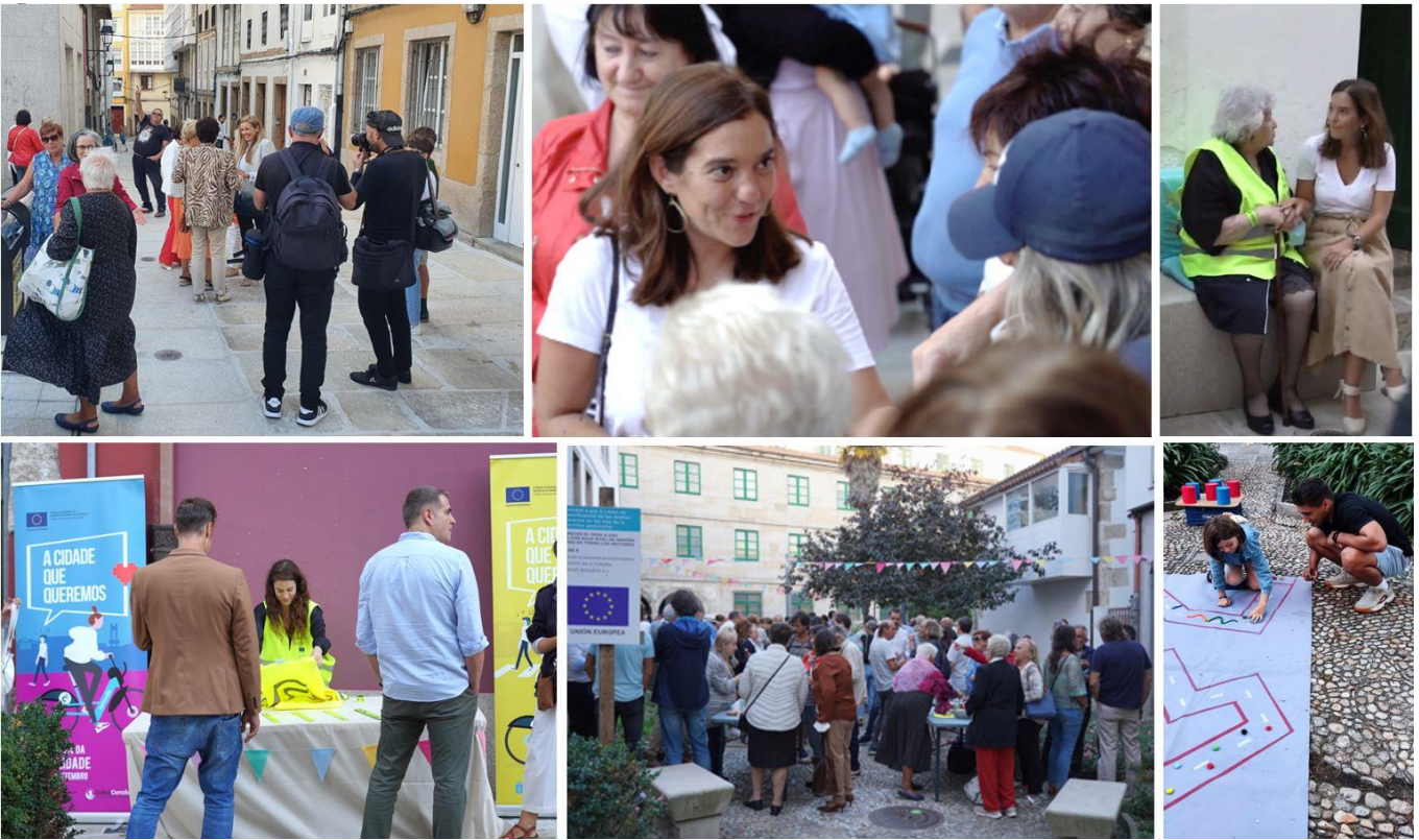
PHOTOS OF THE INAUGURATION PRESIDED OVER BY THE MAYORESS